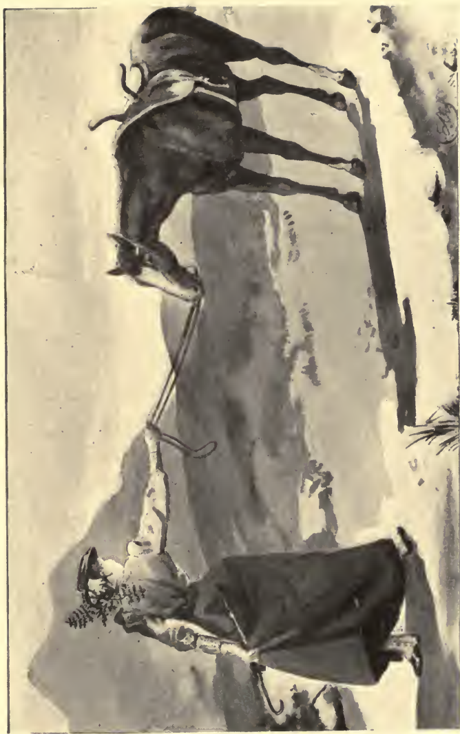
He was dragged by Miss O'Flannigan down the immeasurable lengths of steep road.